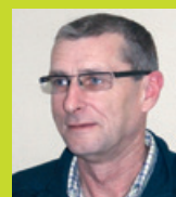
Richard Brown PROJECTS